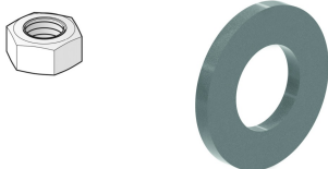
Nut (DIN 934) I6M