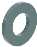
Giant washer (DIN 125-1 A) I6RO